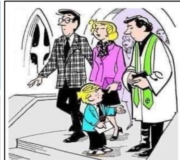
Great Sermon, Pastor. My Dad said "HALLELUJAH" when it was over!

~OR~ Give via text message by texting the amount, you would like to give to (813) 553-5717