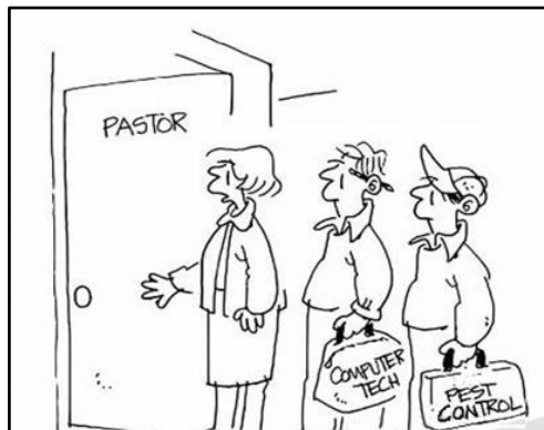
"Which mouse are we having trouble with, Pastor? The church mouse or the computer mouse?"

Did you know our Church offers online giving And text-to-give? They are Easy and Secure! You can give online at: https://fcczh.breezechms.com/give/online