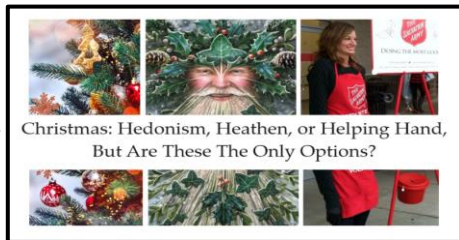
Christmas: Hedonism, Heathen, or Helping Hand, But Are These The Only Options?

AROUND THIS TIME of year, a slew of videos, articles, and blogs appear, all trying to say something meaningful about Christmas. Some will decry the blatant commercialization of Christmas and the loss of its "true spirit." Though often left vague, it